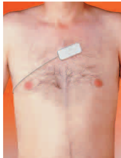
DISPOSABLE respiration sensor