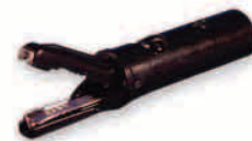
Cod. CROC04F01 alligator clip with 4mm BLACK socket