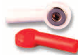
Cod. ADPT4FXX with snap connection and 4mm socket